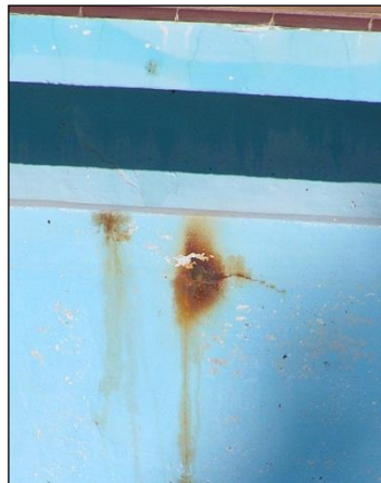
Crack with rust stains.