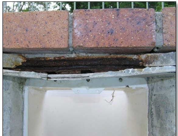
Check the metal plate above skimmer box